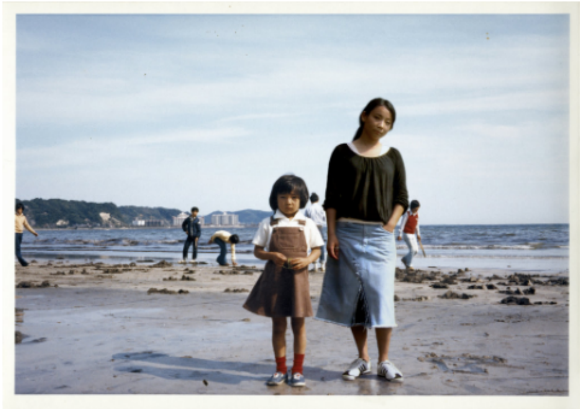
A photograph by Chino Otsuka, titled "Kamakura, Japan, 1976 + 2005," from the series "Imagine Finding Me."