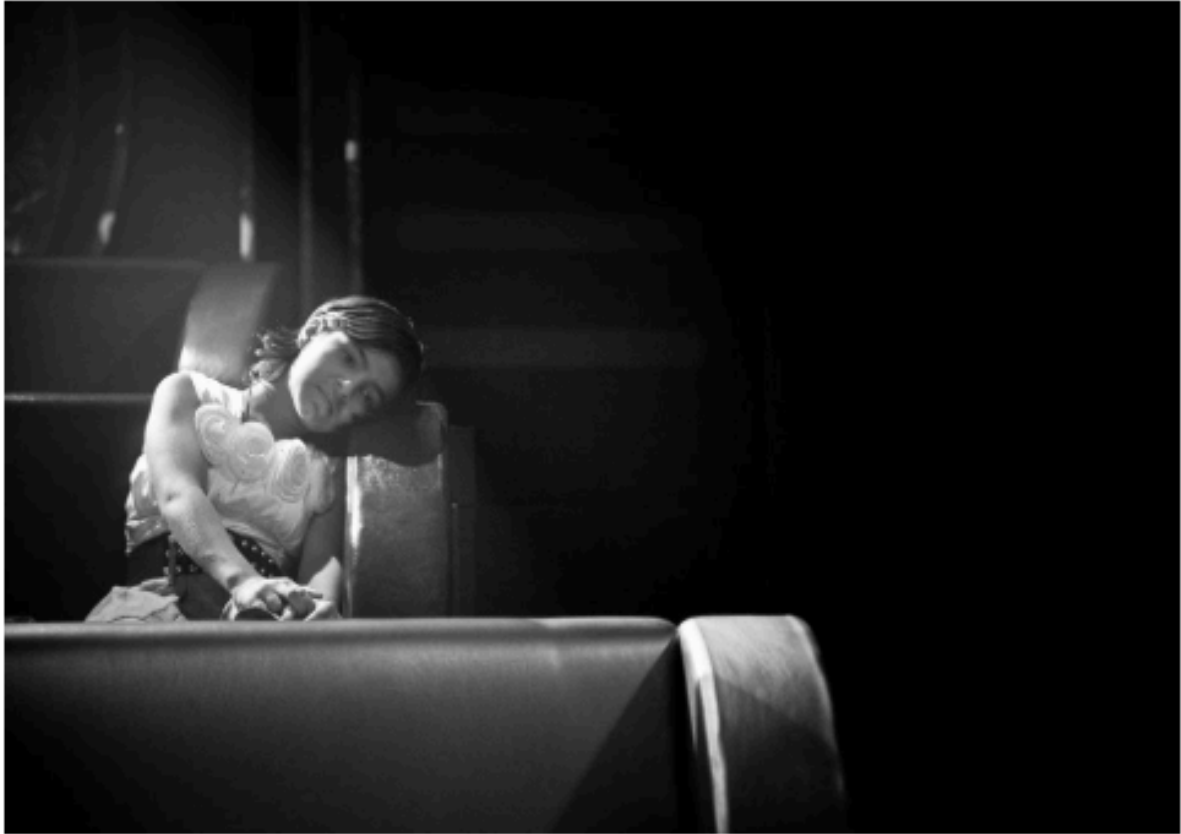
A photograph by Anusha Yadav titled "Sanjana," from the series "In Tune for Fame" (2011).