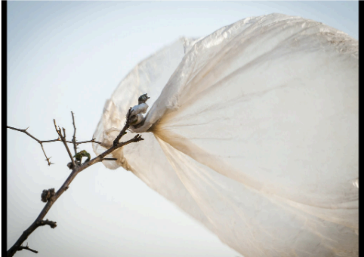
A photograph by Shilpa Gavane titled "1 Clear, when caught, only a sound of it fluttering, comes a whispering, a song of holocaust," from the series "Clear" (2012).