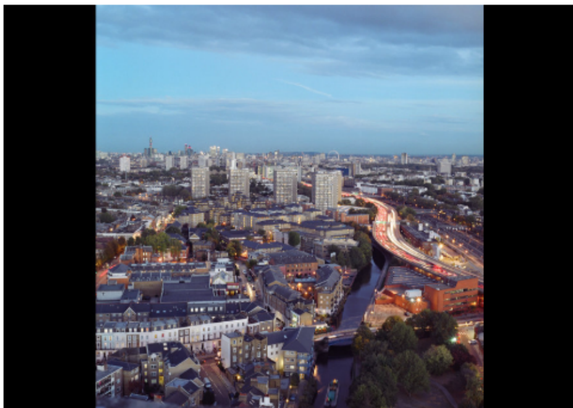
A photograph by Emily Andersen titled "Dusk," from the series "Bird's Eye View from Trellick" (2003).