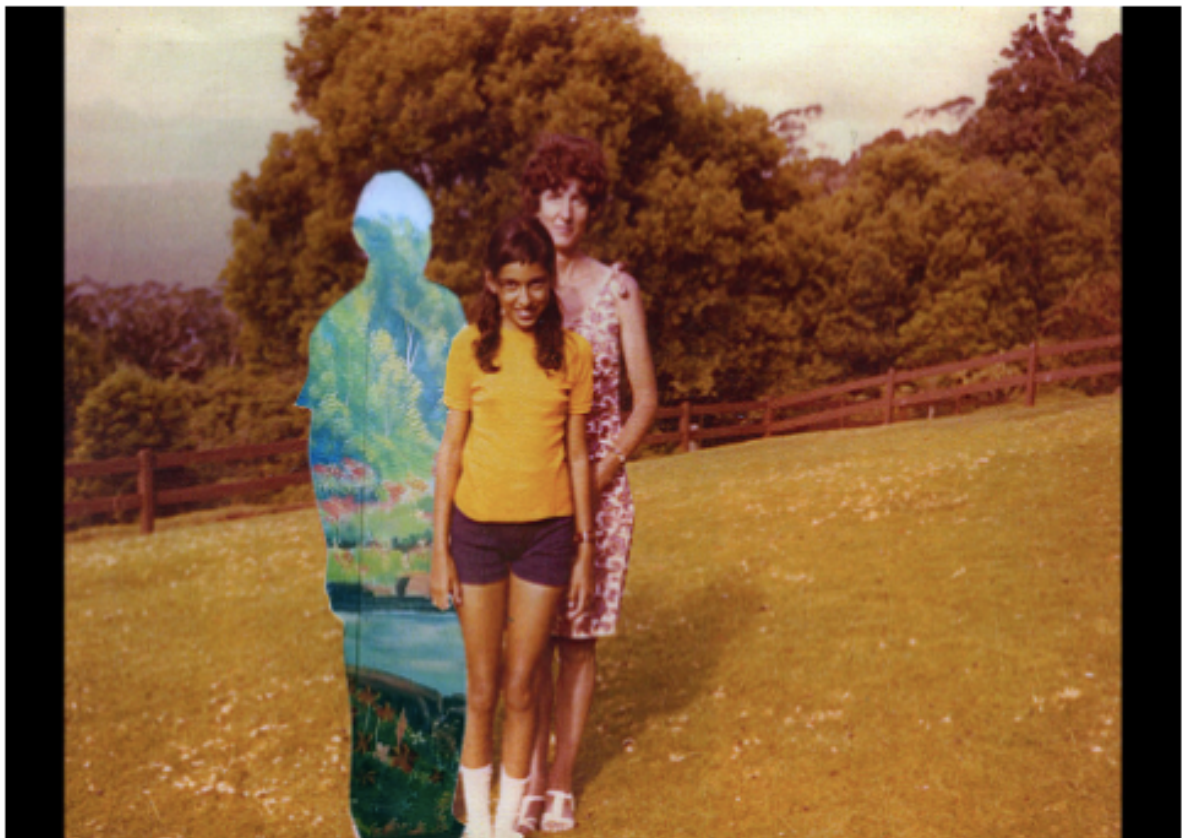
A photograph by Mohini Chandra titled "Mt. Glorious," from the series "Photos of my Father/Imaginary Edens" (2007).