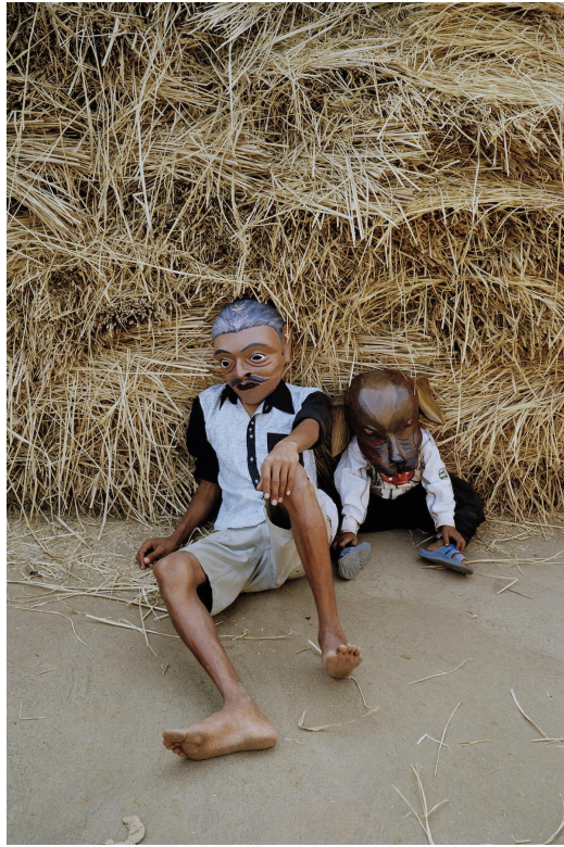
Gauri Gill Untitled from the series "Acts of Appearance" (2015-ongoing)