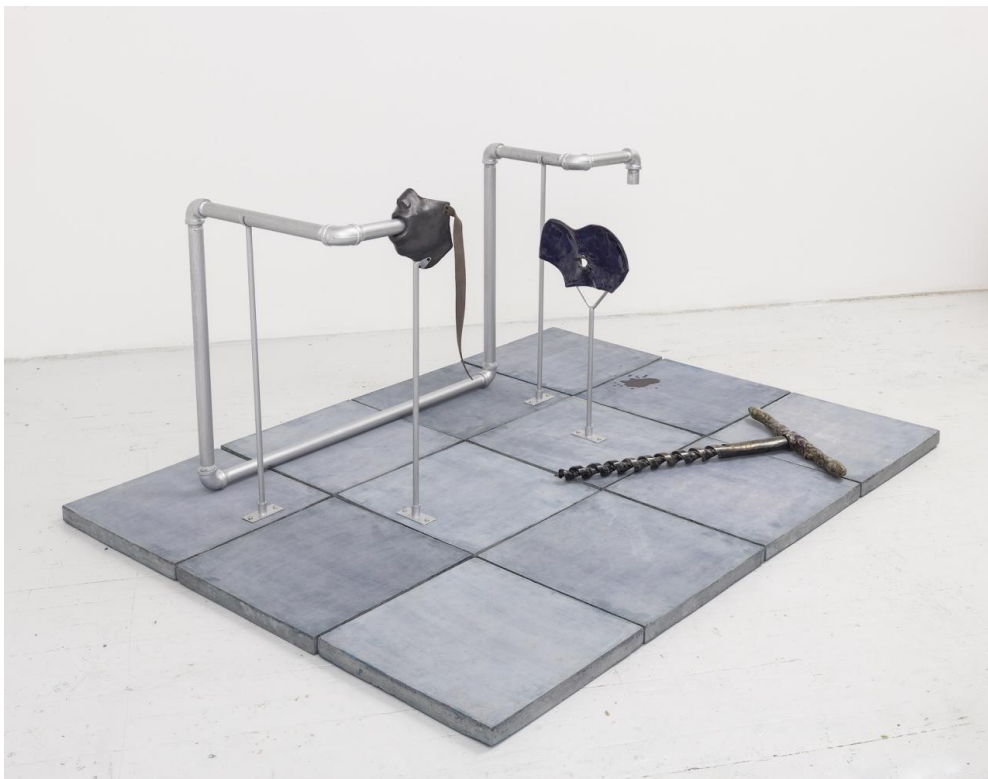
Julia Phillips Extruder (#1) (2017)