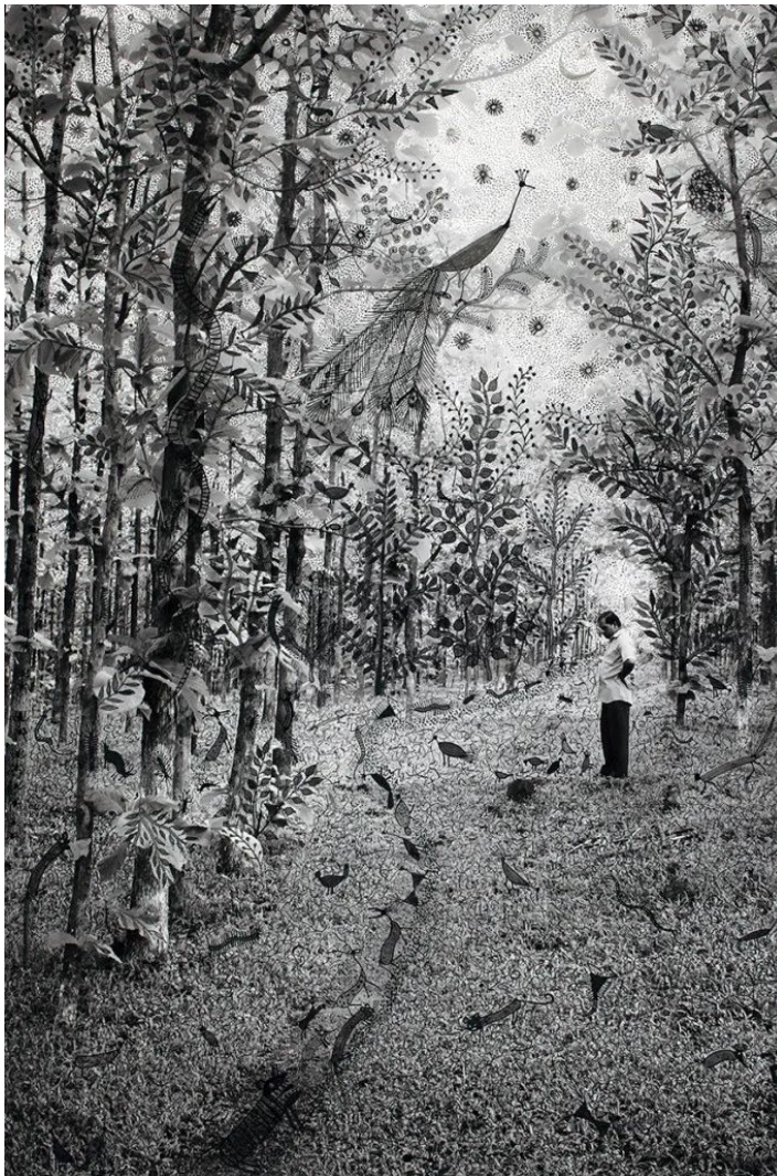
Night Journey of Forest Dwellers. From the series 'Fields of Sight', by Gauri Gill and Rajesh Vangad.

For Vangad, whose Warli world-view is pantheistic, it is an organic extension of his artistic practice to cover the photographic surface with a web of his cosmic forms and terrestrial creatures. Warli art, as practised today, is not a primordial and immutable art form. It has risen to confront the challenges of contemporary economic and political transformations. Once expressed as a ritual and festive iconography painted on dung-coated walls, it has migrated to paper and canvas, with Warli artists addressing sacred and secular themes alike. In fact, Jivya Soma Mashe, the most celebrated Warli artist – to whom Vangad is related – has exhibited alongside the land artist Richard Long in Germany and Italy.