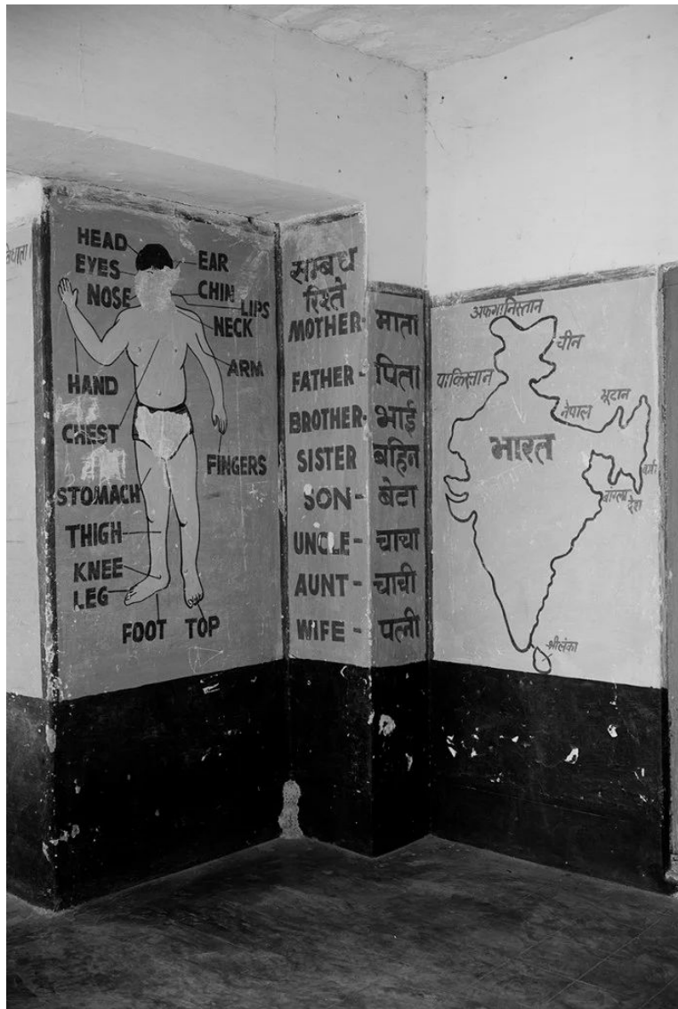
Untitled (32). From the series 'The Mark on the Wall' 1999 – ongoing.