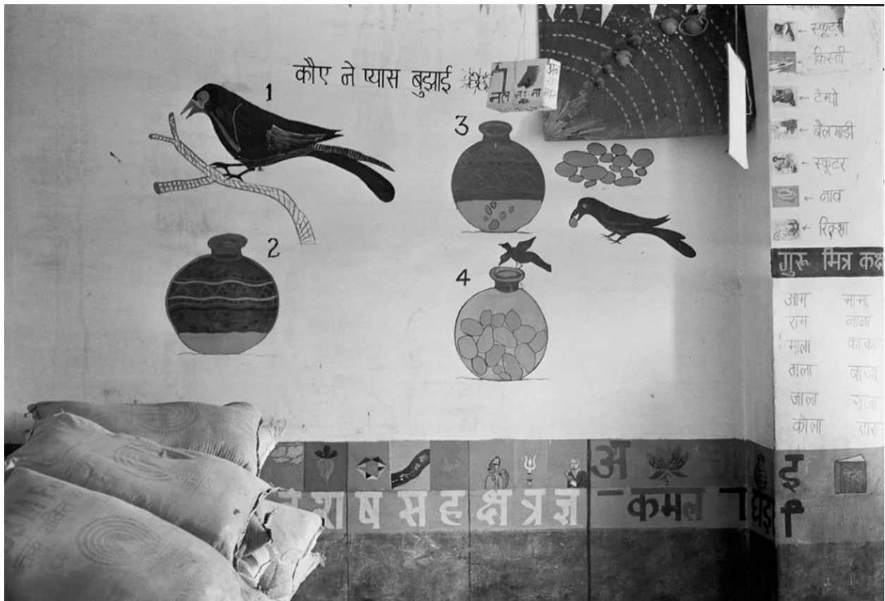
Untitled (16). From the series 'The Mark on the Wall' 1999 – ongoing.